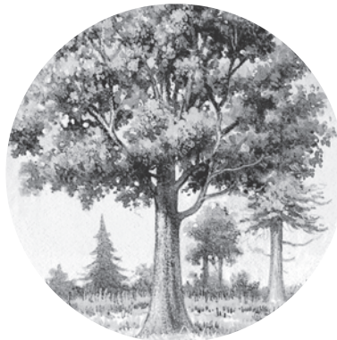
After 100 Years or More As older conifer trees die, they may be replaced by hardwood trees. Oak and maple will grow if the temperature and precipitation are right.