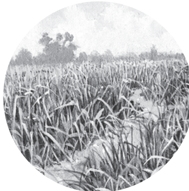
Second Year New weeds appear. Their seeds may have been blown to the field by the wind, or insects may have carried them.