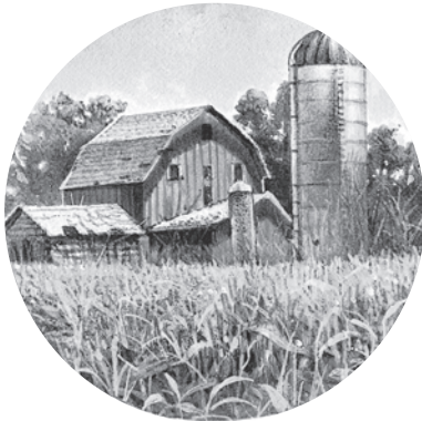
First Year Weeds start to grow.

The figure below shows secondary succession in a farm field that used to be a forest.