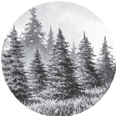
In 5 to 15 Years Small conifer trees, such as pines and firs, grow among the weeds. After about 100 years, the weeds are gone and a forest has formed.